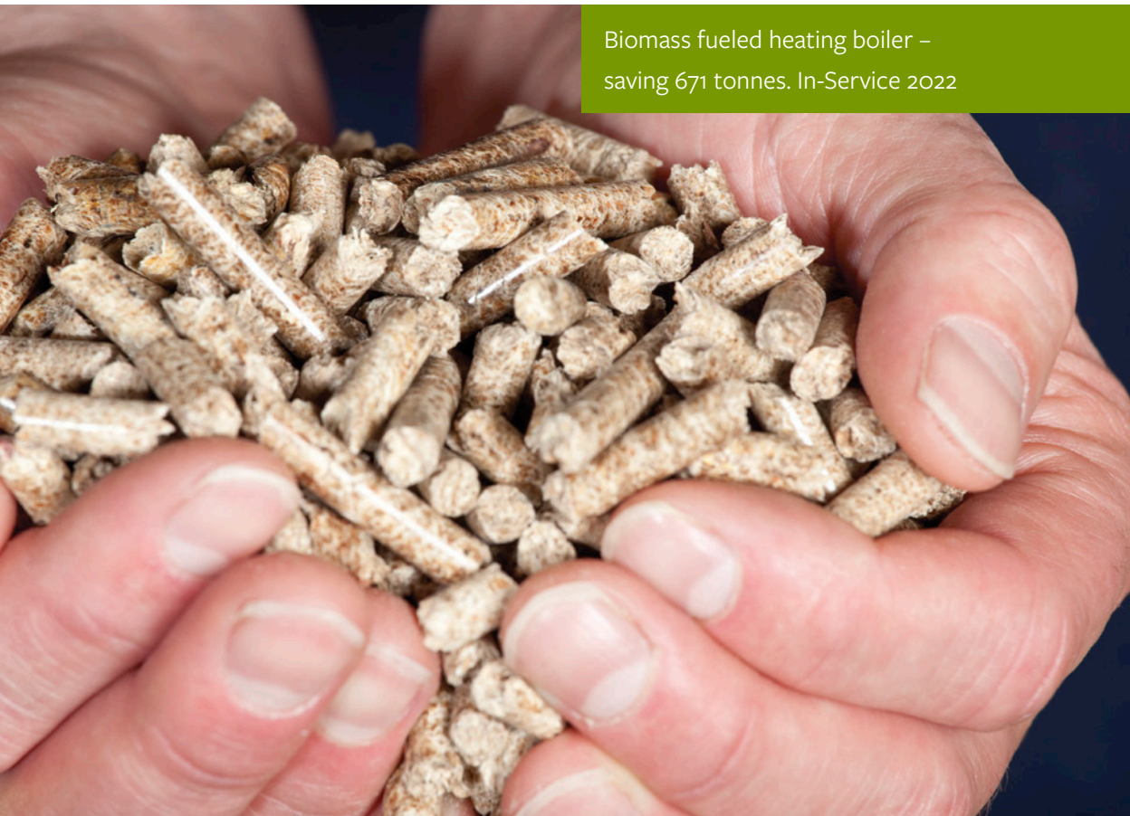
Biomass fueled heating boiler – saving 671 tonnes. In-Service 2022