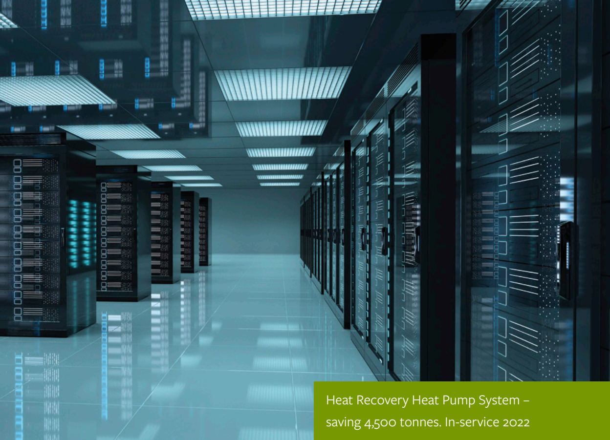
Heat Recovery Heat Pump System – saving 4,500 tonnes. In-service 2022